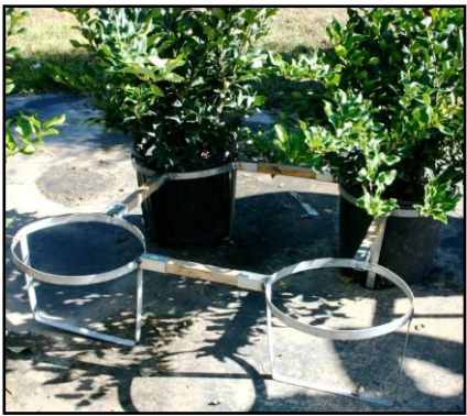
Small - Full rings (1 to 10 gallons)

These photos show newest concept for container support. Galvanized steel rings and stands can be configured into rings of four or other shapes shown. The large sizes are split rings for 15, 20, and 25 gallon sizes, while the six smaller sizes have full rings for 1 to 10 gallon sizes